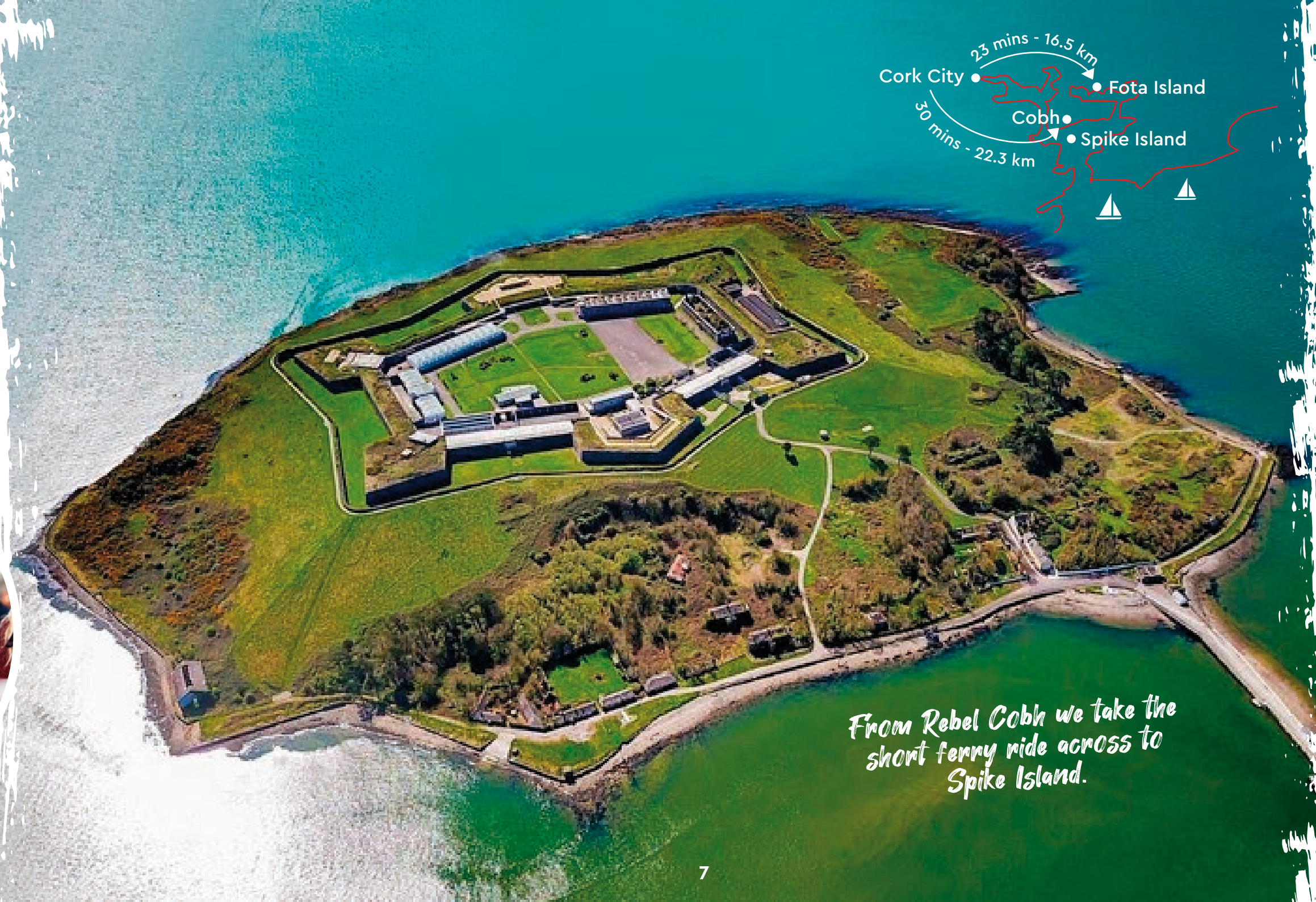
From Rebel Cobh we take the short ferry ride across to Spike Island.