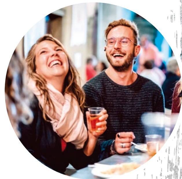
Fota House and Gardens